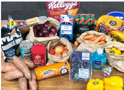
Example of a £5 shop

We know choosing the items you like for your family is really important and so we have a wide range of products to select from each week with new lines added each day.