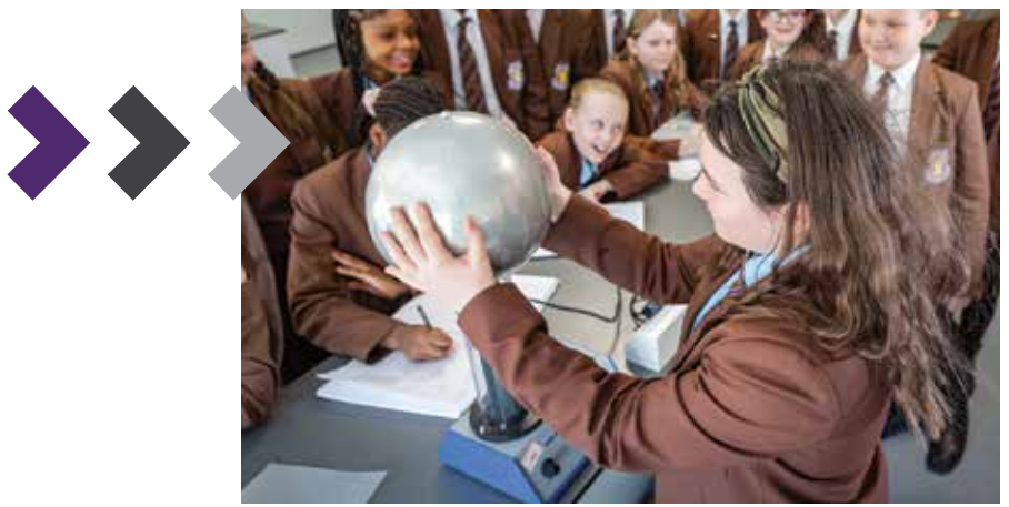
This course will run if it is selected by a viable number of students.

Separate science includes the same topics as combined science with a selection of topics from each discipline having extended subject material and a higher maths demand and so requires a huge amount of commitment. We expect students who chose this option to be willing to complete independent study outside of the classroom.